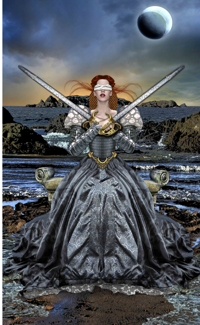
2 of Swords Tarot Illuminati © Erik Dunne

Number - 2 Separation & connection, duality, initiation, unifying